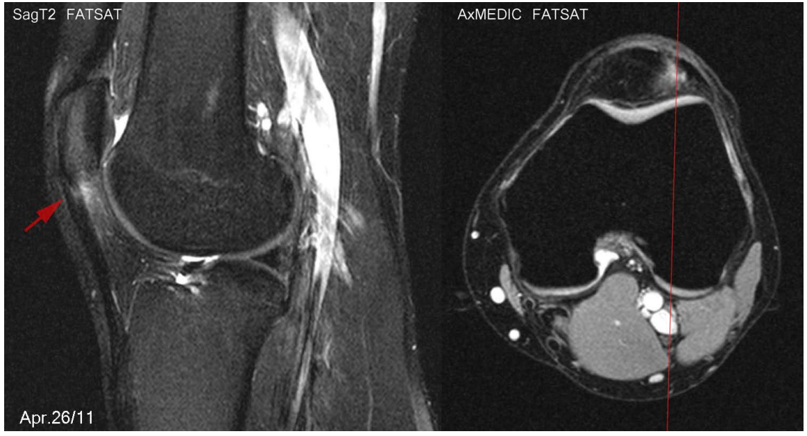
Figure 2 A second MRI (T2 weighted) that revealed an increase in size of the patellar tendon defect to 8mm

of the right sacroiliac (SI) joint, extremely limited dorsiflexion at the left ankle mortise joint and hypomobility of the left subtalar joint, along with hypertonic bilateral iliopsoas, left hamstring, gastrocnemius and soleus muscles. The patient was co-treated by the chiropractor and a registered massage therapist with low-level laser therapy, soft tissue therapy consisting of muscle release therapy and trigger point therapy to the musculature of the hip, thigh and lower leg, spinal manipulative therapy to the right SI joint, extremity manipulative therapy to the left ankle mortise and subtalar joint, and active daily quadriceps stretching for four weeks. She was also instructed to lessen the degree of impact and volume of her training in preparation for a major international event taking place in four weeks. Following the competition and after one month of complete rest, the patient had no pain on walking and only minimal pain on palpation of the patellar tendon. She returned to training with aqua jogging and rehabilitation with eccentric squats for four weeks. The patient gradually returned to the track by initiating jogging, sprinting, and then jumping over a two month period. During this time the patient was symptom-free.