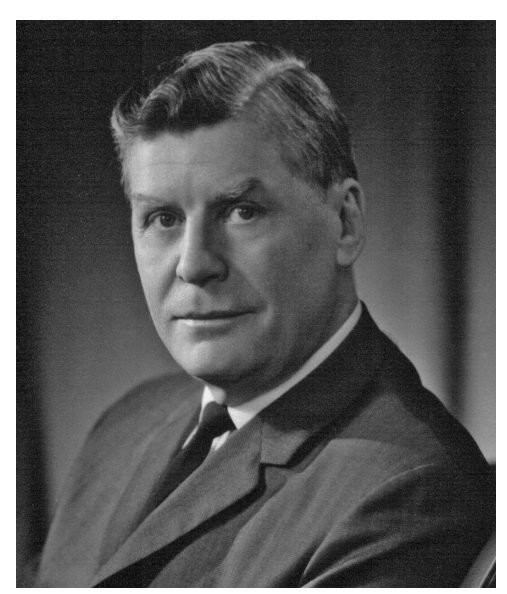
Figure 7. Oswald Hall.