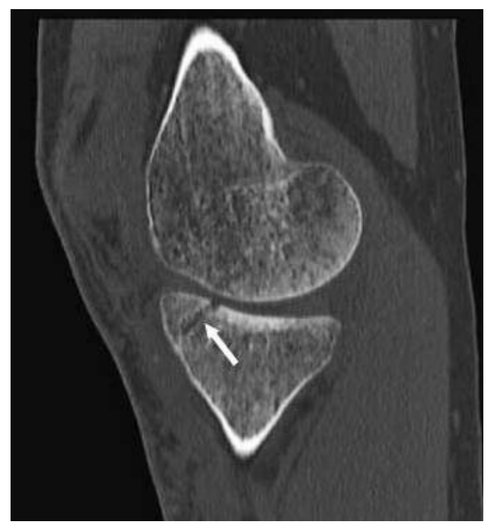
FIGURE 2a: CT Knee – Sagittal Slice A cortical defect is noted at the anterior portion of the medial compartment, underneath the anterior horn of the medial meniscus, confirming the presence of an intraarticular fracture (arrow). Mild joint effusion is present.

Computed tomography (CT) of her left knee revealed a 1.5 mm cortical defect into the anterior portion of the medial compartment, underneath the anterior horn of the medial meniscus, with mild joint effusion present (Figures 2a and 2b). The CT images, read by a medical radiologist, confirmed the presence of a subacute, undisplaced intra-articular fracture involving the anteromedial corner