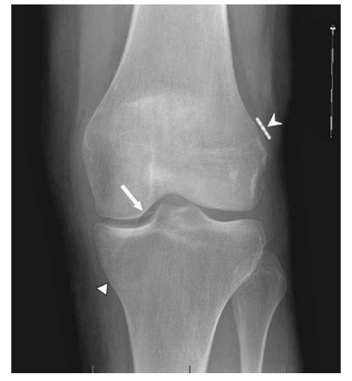
FIGURE 1a. AP Knee View

Upon further review, these radiographs showed a small