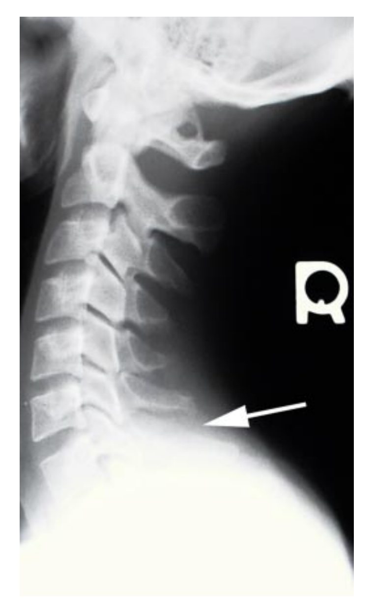
Figure 2 Lateral view. Follow-up films 2.5 months post injury reveal osseous callous formation at the fracture site.

Follow-up radiographs five months post-injury revealed that the spinolaminar fracture had healed (Figure 3).