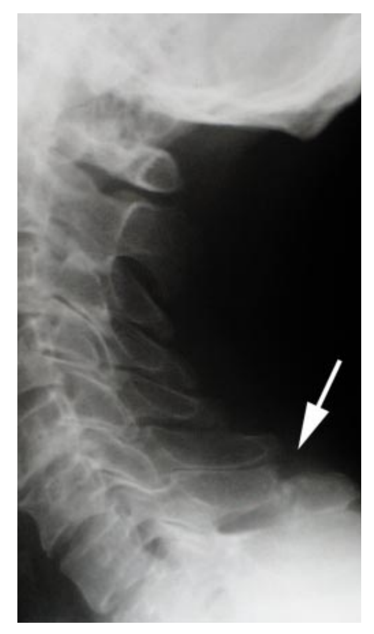
Figure 4a Lateral View. The clay shoveler's fracture is typically located midway between the spinous tip and spinolaminar line.

serrated with the distal spinous fragment either displaced posteriorly or posterior-inferior. Lateral displacement can be best visualized on the AP view. On the AP view, malalignment and displacement of the distal spinous fragment lead to simultaneous visualization of the fractured base and the caudally displaced spinous tip. This feature has been termed the "double spinous" sign (Figure 4b)