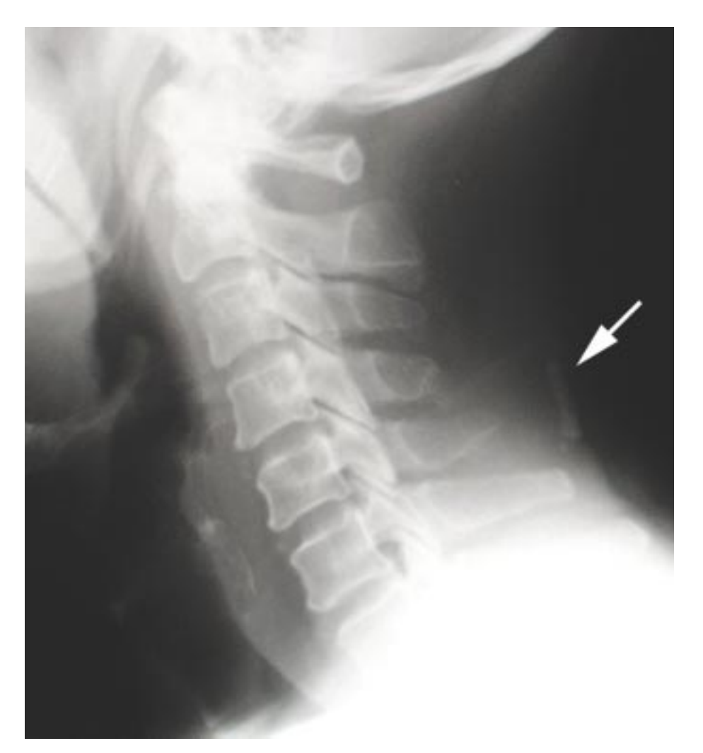
Figure 6 Lateral View. Nuchal Ligament Ossification. The elongated shape of the nuchal ossification and intact spinous tip helps differentiate this from a clay shoveler's fracture.

and upper dorsal spinous processes. Radiology 1951; 56:427–429.