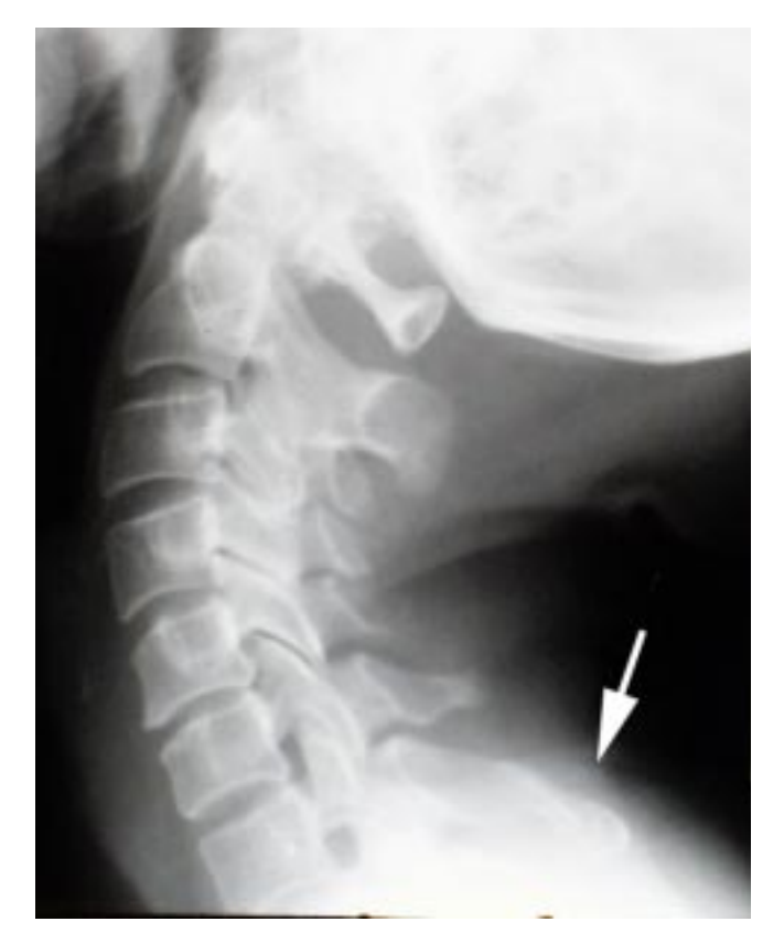
Figure 5 Lateral view. Nonunion of the secondary growth centre of the C7 spinous process. Note the smooth, undisplaced sclerotic margins between the osseous segments.

(Schmitt's Disease): A report of two cases. British J Radiol 1957; 30:378–380.