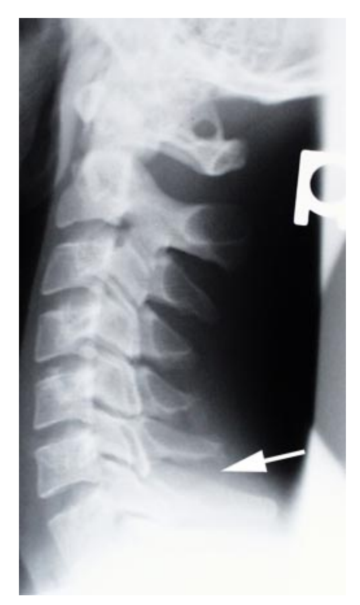
Figure 3 Lateral view. Follow-up films five months post injury reveal complete healing of the clay shoveler's fracture.

The final mechanism may be regarded as a stress-related, fatigue-type fracture. In this mechanism, repetitive normal stress in abnormal bone may lead to a fatigue fracture. A case of a transverse fracture through the seventh spinous process in the cervical spine has been reported in a patient with secondary hyperparathyroidism.<sup>16</sup>