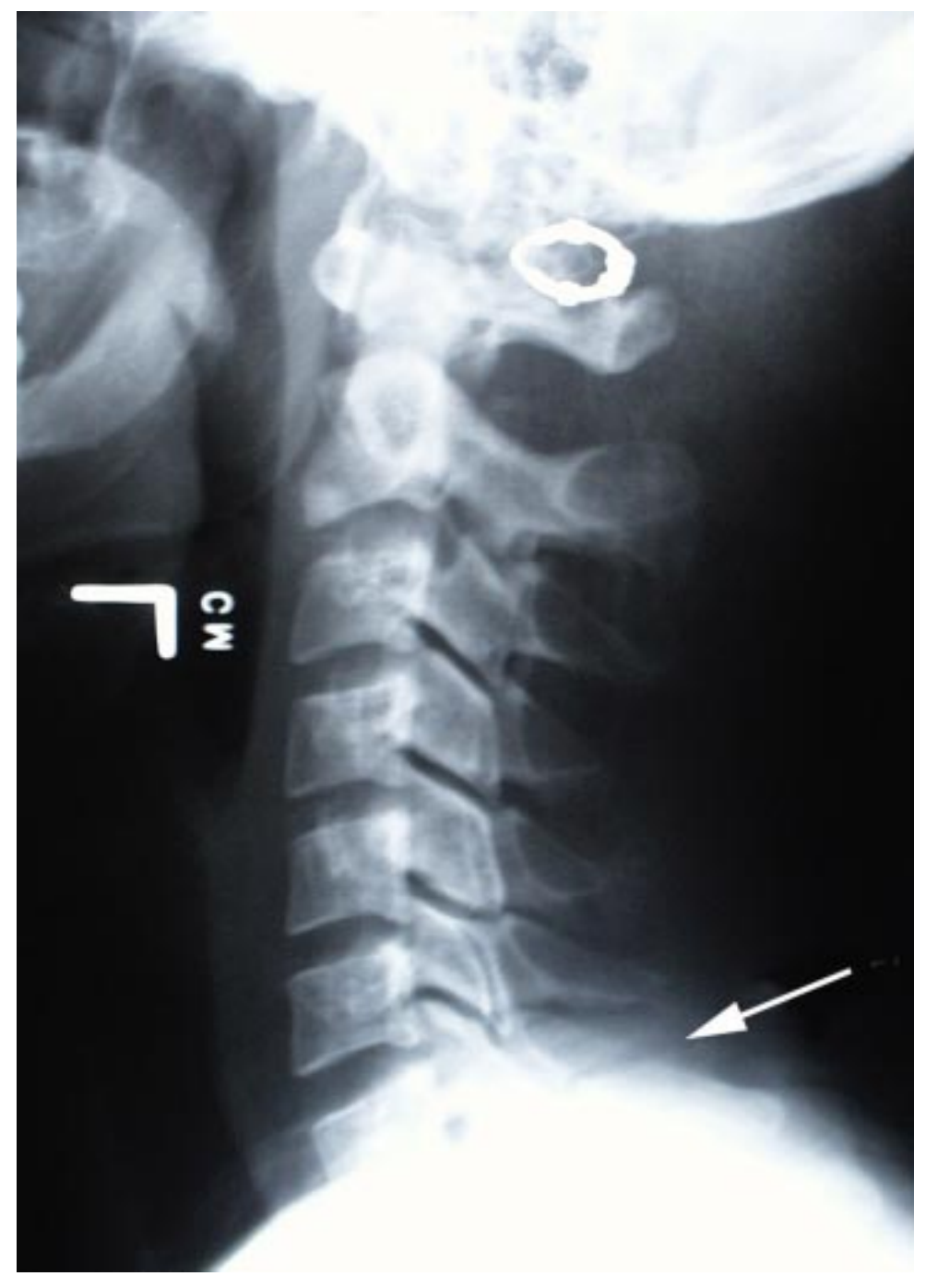
Figure 1 Lateral view. Initial injury showing avulsion fracture through the spinous process and lamina of C7. The fracture extending into the lamina raised the possibility of spinal cord involvement. Note the minimal inferior displacement.