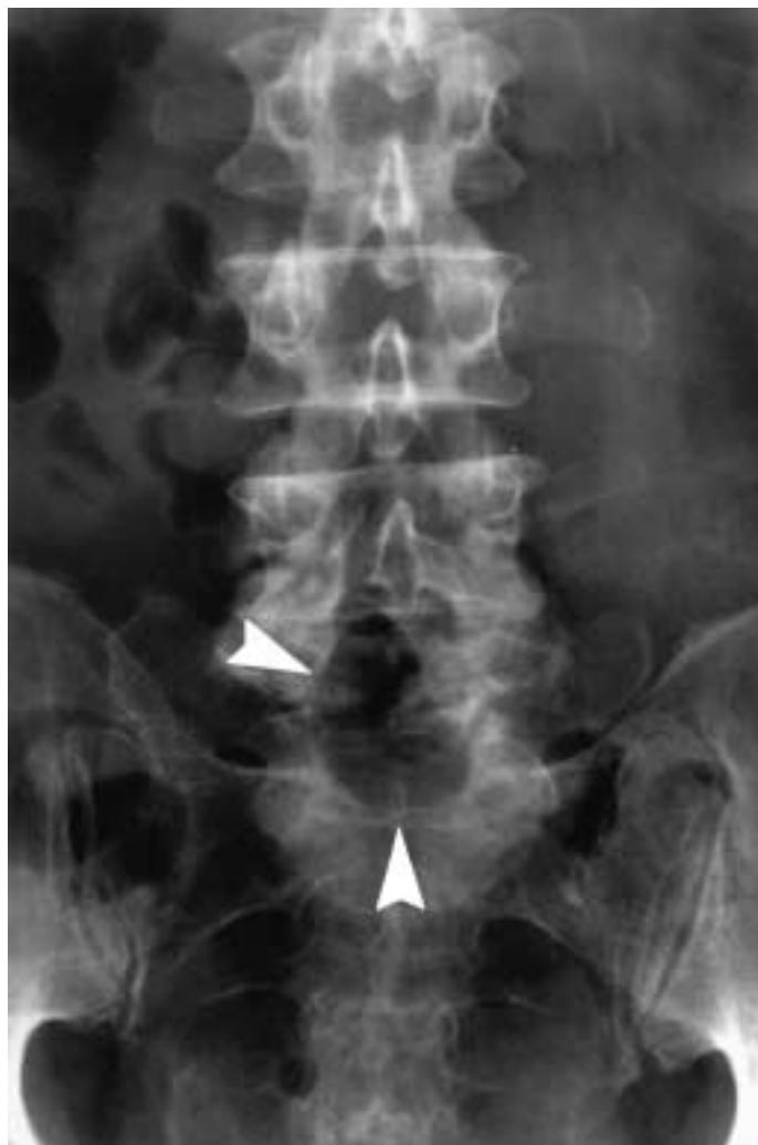
Figure 1B Plain film radiograph, anteroposterior view of lumbar spine demonstrating previous laminectomy at L5 and L6 (arrowheads).

with mechanical low back pain, was prescribed analgesics and laxatives, and told to follow up with his medical doctor if needed.