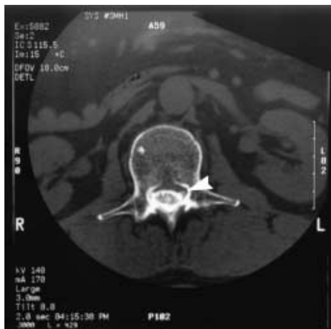
Figure 3A Axial computerized tomography scan with contrast at L1 level, demonstrating lack of thecal sac indentation and preservation of L2 nerve root within the canal (arrowhead).

herniation involving the L2, L3 nerve roots and cauda equina (Figures 3A and 3B). A diagnosis of a posterolateral disc herniation at L-2 resulting in cauda equina compression was made, and the patient underwent an uncomplicated laminectomy to remove the sequestered fragment at that level.