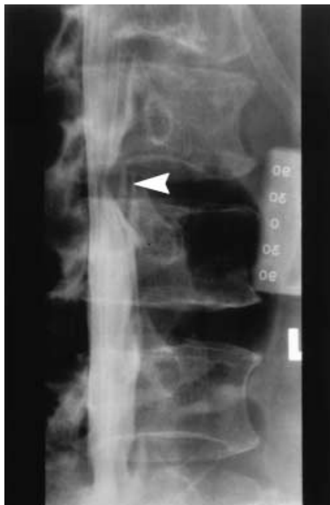
Figure 2 Plain film radiograph with myelography, oblique view of lumbar spine demonstrating indentation of myelographic dye column, indicative of an extrathecal space-occupying lesion.

Nine days later, the patient represented to the Emergency ward complaining again of low back and leg pain, as well as a 15 hour history of being unable to urinate. As well, he had not had a bowel movement in three days. There were no complaints of numbness or weakness in the left leg. The patient denied any right leg symptoms. In retrospect, the patient reported that over the previous week he had experienced some dribbling of urine on several