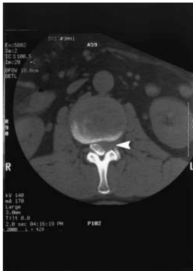
Figure 3B Axial computerized tomography scan with contrast at L2 level, demonstrating severe compression of the thecal sac by lumbar disc herniation, and obliteration of the L2 nerve root (arrowheads).

Cauda equina syndrome (CES), first reported in the medical literature in 1929, 8 is thought to be rare. With an estimated occurrence of 1 to 16% of lumbar disc herniation cases that undergo surgery, 9,10 annual incidence of CES has been estimated at 1 in 33,000 to 100,000. 2