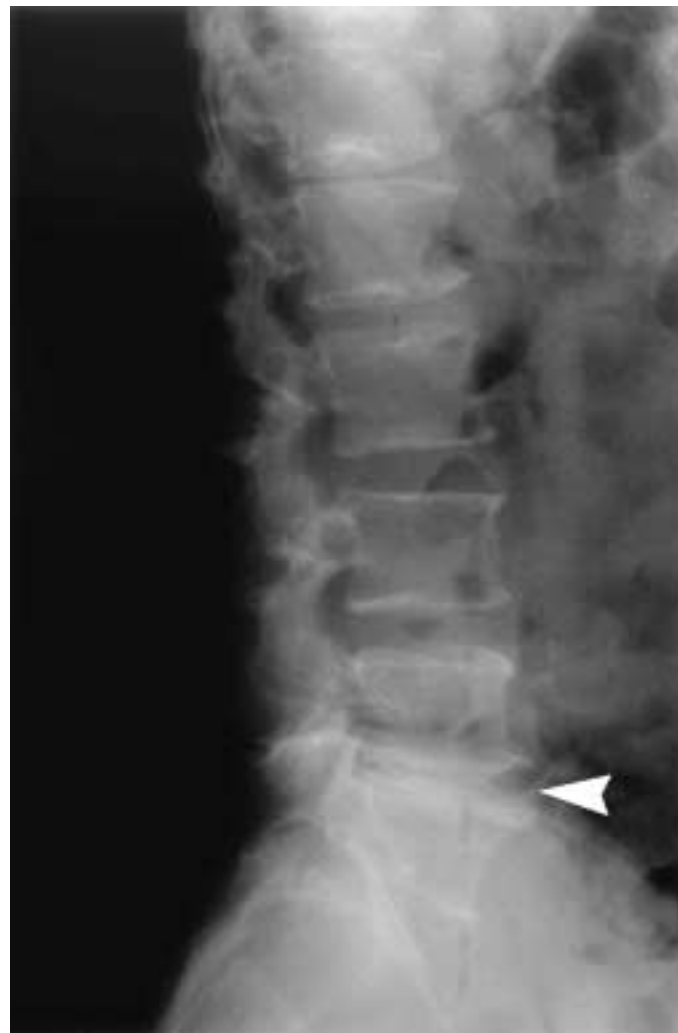
Figure 1A Plain film radiograph, lateral view of lumbar spine demonstrating 6 lumbar-type vertebrae, and severe degenerative disc disease at L5-6 (arrowhead).

A 53-year-old male manager presented to an Emergency physician with complaint of low back and leg pain. The pain had begun a week previously, and was brought on after sneezing. Immediately afterwards, the patient experienced back “spasms” in the lower lumbar region, with radiating pain into the left buttock and anterior thigh. He had presented to his family physician three days later and was prescribed analgesics. At the time of the presentation, the patient reported that the leg pain was getting progressively worse, and was aggravated with activity, sitting, standing and coughing, and was relieved by resting prone. Previous medical history was significant for lumbar surgery 20 years ago, to remove a herniated lumbar disc.