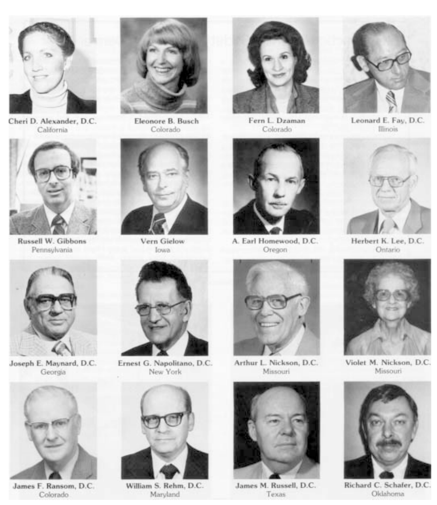
Figure 20 Founders of the Association for the History of Chiropractic; from Chiropractic History 1981