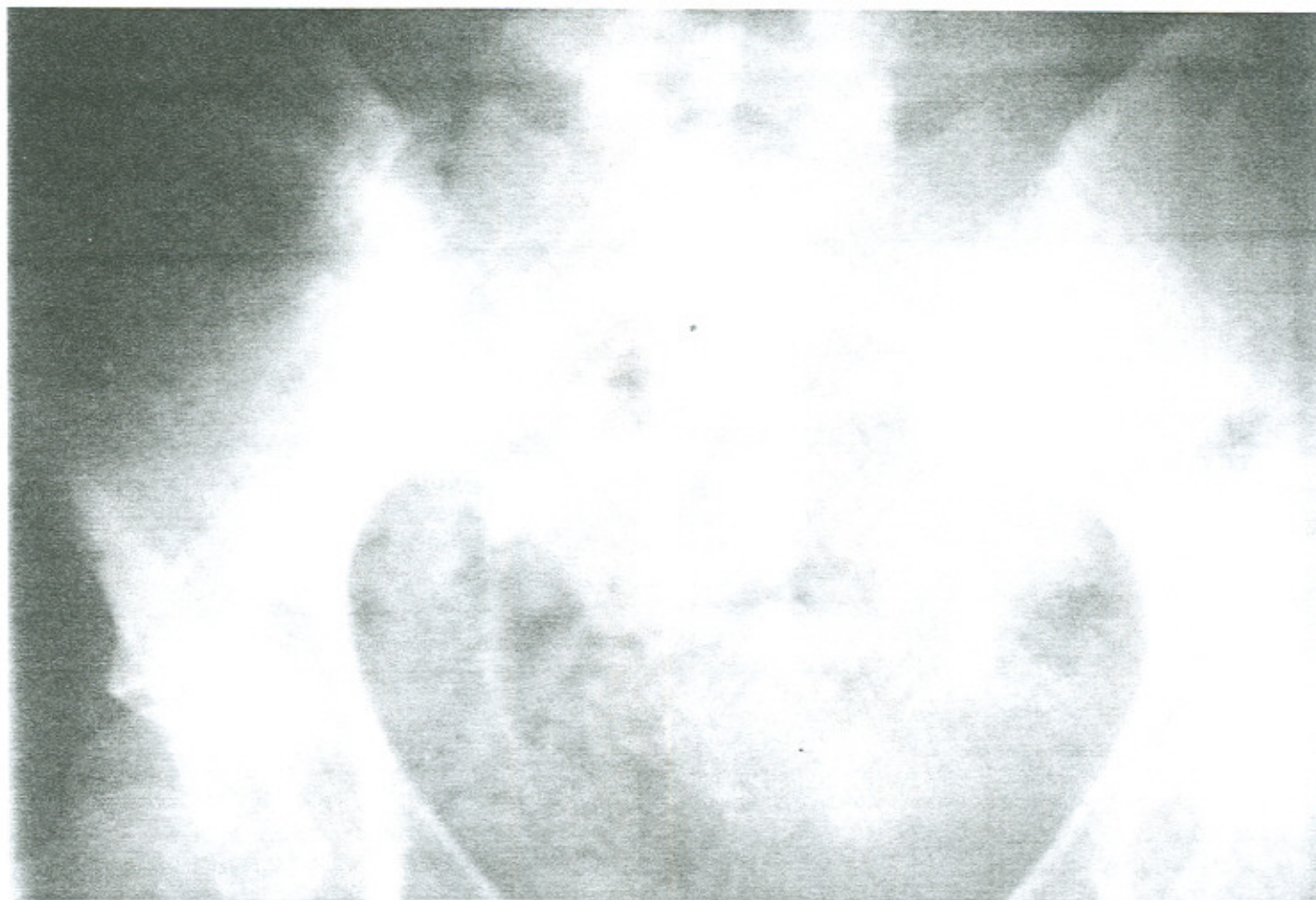
Figure 1 (a) Radiograph of pelvis demonstrating large nutrient foramen in right ilium.

plying the medullary cavity. They then divide into radial branches that enter the cortex and anastomose with branches from the periosteal plexus in the haversian canals. This demonstrates the double blood supply to the cortex. 3