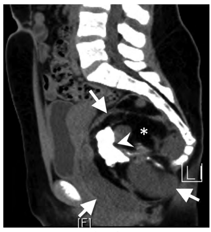
Figure 3: Sagittal unenhanced CT image of the pelvis shows the presacral mass (arrows) containing fat (asterisk), calcification (arrowhead) and soft tissue. The calcified components show hyperdense attenuation on CT image.

Incidentally discovered teratomas in various clinical settings have been described<sup>3</sup>, however no cases have been described related to incidental discovery on routine scoliosis radiographs. Given the gravity of potential complications, such as bowel obstruction, ovarian torsion, hemorrhage and rupture, and consequently, peritonitis, it is important for the chiropractic community to familiarize themselves with the typical radiographic appearance and epidemiology of mature pelvic teratomas.