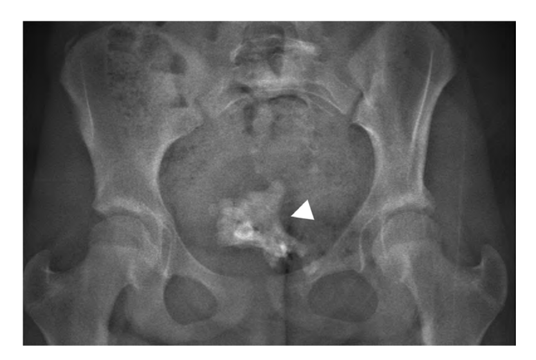
Figure 1: (page 22) A. Posteroanterior full spine radiograph shows a calcified, and likely ossified, amorphous pelvis mass (arrowhead). (right) B. Cropped, magnified view of pelvic mass.