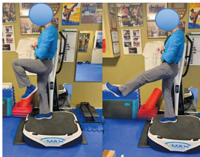
Figure 1. Front kick.

On examination, lower extremity deep tendon reflexes were 2+ bilaterally and light touch sensation examination was unremarkable. In addition, heel and toe walking were normal with pain at the end range of flexion during the squat test. His right knee (ROM) flexion and extension were reduced by 10% with pain in the lateral knee. The bounce home test, McMurray, Anderson and Lachman tests were positive on the right. Pivot shift, valgus loading, posterior drawer and posterior sag were negative. There